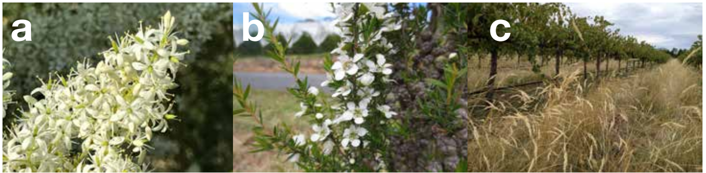
Figure 1. Australian native insectary plants (a) Christmas bush, B. spinosa , (b) prickly tea-tree, L. continentale and (c) Wallaby grass, Rytidosperma ssp.