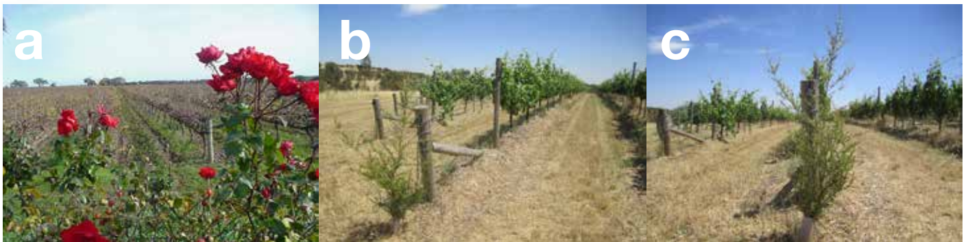
Figure 2. Rose bushes have been traditionally used at the end of strainer posts and offer no intrinsic benefit (a) C.A. Henschke and Co. have incorporated Christmas bush at the end of their strainer posts (b,c) and it is suggested that the use of native plants may be a better alternative.